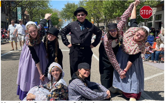
Hamilton Community Schools were once again well represented in the Tulip Time Festival parades in May! Our Hamilton High School & Middle School bands marched and our Dutch Dance program had stellar performances throughout. Well done, Hawkeyes!