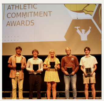
Athletic Commitment award given to athletes who have received 12 varsity letters during their high school career.