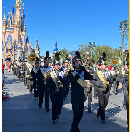
By: Zach Harig