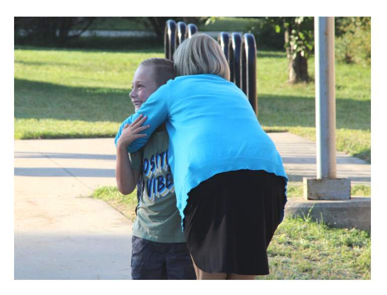
On August 24, students returned to their classrooms across the district. The morning was filled with hugs, smiles, laughter, and learning!